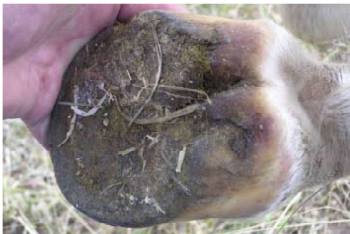
(above) The redness that you can see in the heels is bruising in the foot trying to come out.