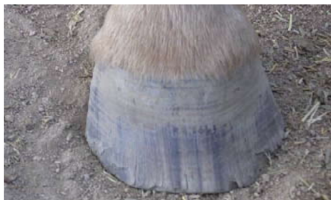
(above) The rings at the top of this hoof are not a sign of a healthy foot or stomach.