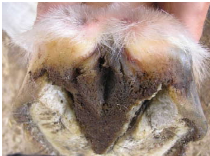
(above) The same foot again viewed from underneath. Right where the bulbs of the heels meet the frog you can see a lot of bruising and the frog doesn't look healthy as it will be releasing a lot of toxicity.