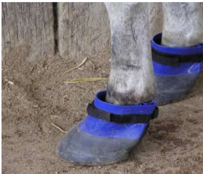
Soaking the feet in the Davis soaking boots.

The advantages of soaking boots are that you don't need to stay there with the horse while the feet are soaking and you can soak all four feet at once. However once your horse is used to it you can also soak all four feet at once in the tubs. With the soaking boots the water stays warmer for longer and you don't have to use as much product. The boots also are easier if you don't have the convenience of a concrete wash bay. After having scrubbed the hoof clean prior to soaking you don't really want your horse putting his foot down in the dirt if he takes it out of the bucket and then have to put the dirty foot back in to continue soaking. The disadvantage of the boots is that you can't massage the coronet band or the heels as easily.