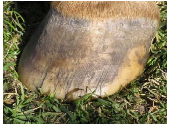
(above) These cracks in the wall are most likely due to the body not having the right nutrition. They provide the perfect environment for infections to enter and live. Improving the diet, soaking the feet and treatment with energy work will all be needed to improve this foot.

Following are some pictures showing different signs that indicate the feet aren't healthy and some of the results and parts of the processes of healing after soaking the feet and energy treatments.