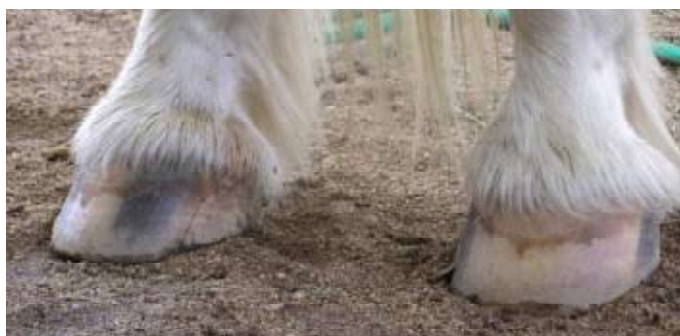
(above) Another example of where 'rubbish' is shifting out from the body through the coronary band indicated by the dark, dirty band around the hoof wall.