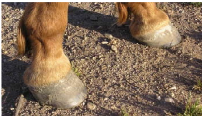
(above) A white line around the coronary band or dry flaky hoof wall around the coronary band all indicate 'rubbish' being expelled from the body. This horse has very small feet for his size and contracted under run heels due to the congestion in his feet. After just one week of soaking the feet and energy work it was remarkable just how much this horse's feet opened up and improved. Looking at this horse's diet would also be recommended to see if there was something he was eating that was causing his body to have so much toxicity in it.