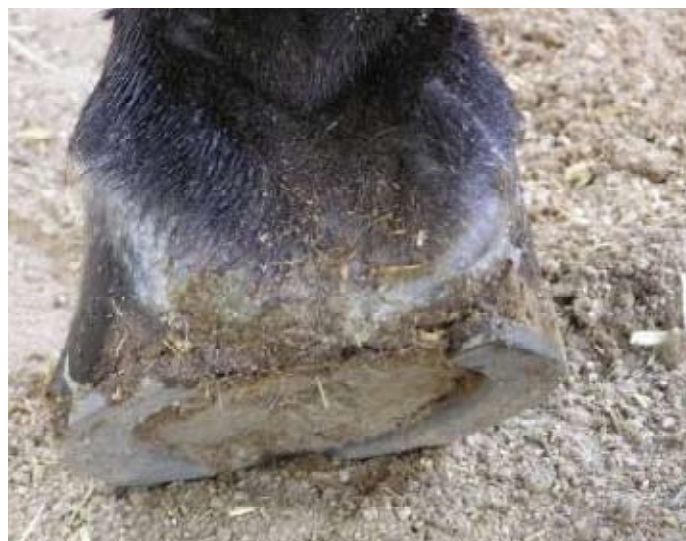
The white waxy substance on the coronary band and at the heels is the 'rubbish' that has come out after soaking.

If you are using buckets or tubs to soak the feet you want the water to at least cover the coronet band and the bulbs of the heels. Higher is better. So depending on the size tub you use this will take about 5 litres of water per tub.