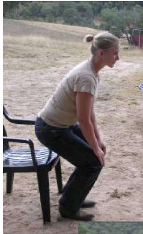
Figure 1 (left) Allowing the upper body to incline forward means staying in balance and moving with ease.

The rider's upper body needs to be inclined forward as the rider moves in between the sit phase and the rise phase. The degree of this forward incline is dependent upon many factors for example the speed, terrain, balance of the horse, length of stirrup, length of stride etc so you will just have to experiment to find where feels the most balanced and effortless. The shoulders and the hips need to be always counterbalancing each other.