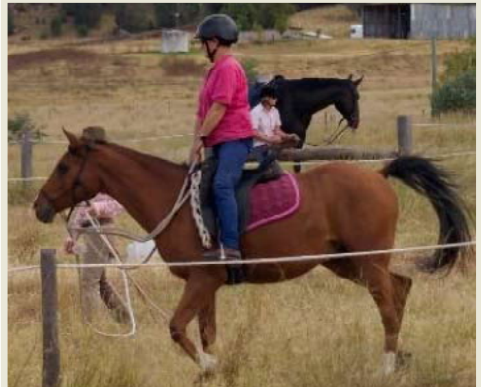
Figure 8-photo by Greg Johnstone- here is the 'rise phase' before correcting the rider's position and balance. There is quite a lot of downward pressure on the stirrup here. Again the horse's posture is the evidence of the rider's state of balance.

Figure 7-photo by Greg Johnstone- Here the rider is out of balance. The legs are too far forward causing the rider to 'fall' back in the saddle rather than place the seat lightly in the saddle. The rider is too upright for this 'sit phase' and is behind the movement of the horse. This means that it will then take a big effort to rise because of the lack of balance. The effect that it has on the horse is that the horse's back flattens, the hinds legs can't step through underneath and the head and neck is raised to counterbalance the trailing hindquarters. The expression on the horse is not a happy one.