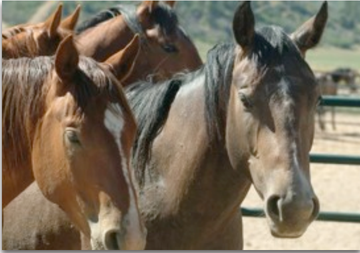
Uncertain about what is going to happen