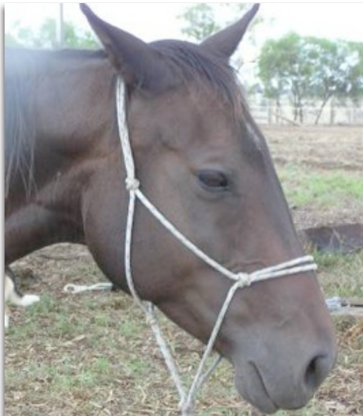
Not interested, bored, despondent, tired