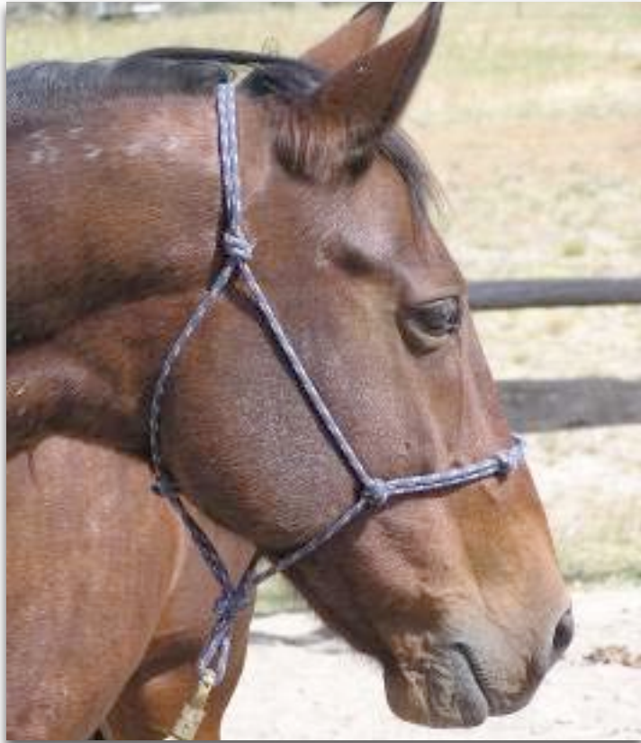
Interested, happy, contented

Generally as a society we have been conditioned not to look at the deeper emotions of animals. Following are some pictures which may help you in getting started in being able to take a deeper look into what is going on for horses.