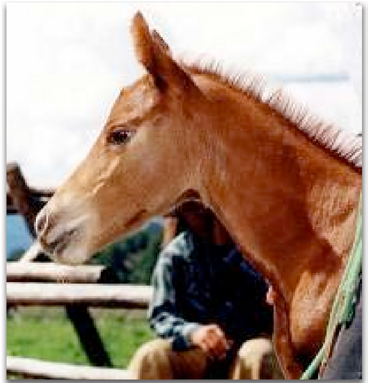
Anxious and unsure, but trying hard to be brave.