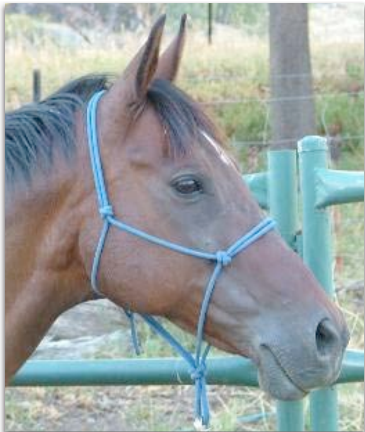
Happy, interested and looking forward in life.