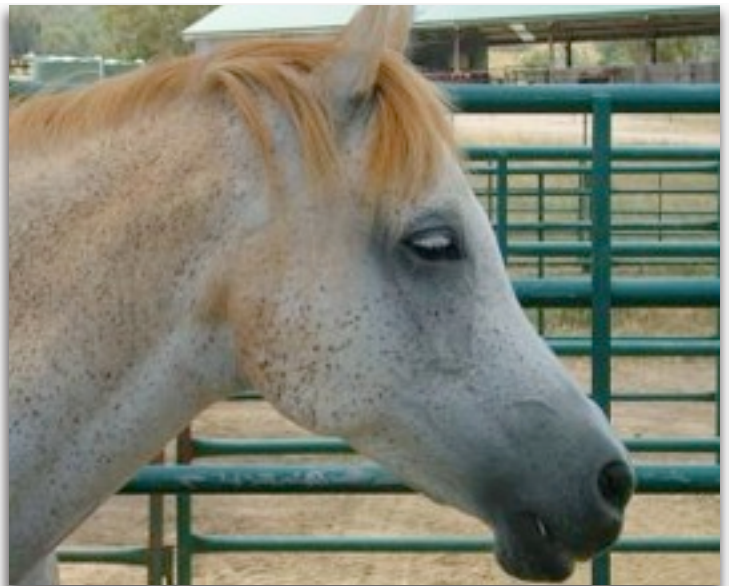
Becoming peaceful and happy