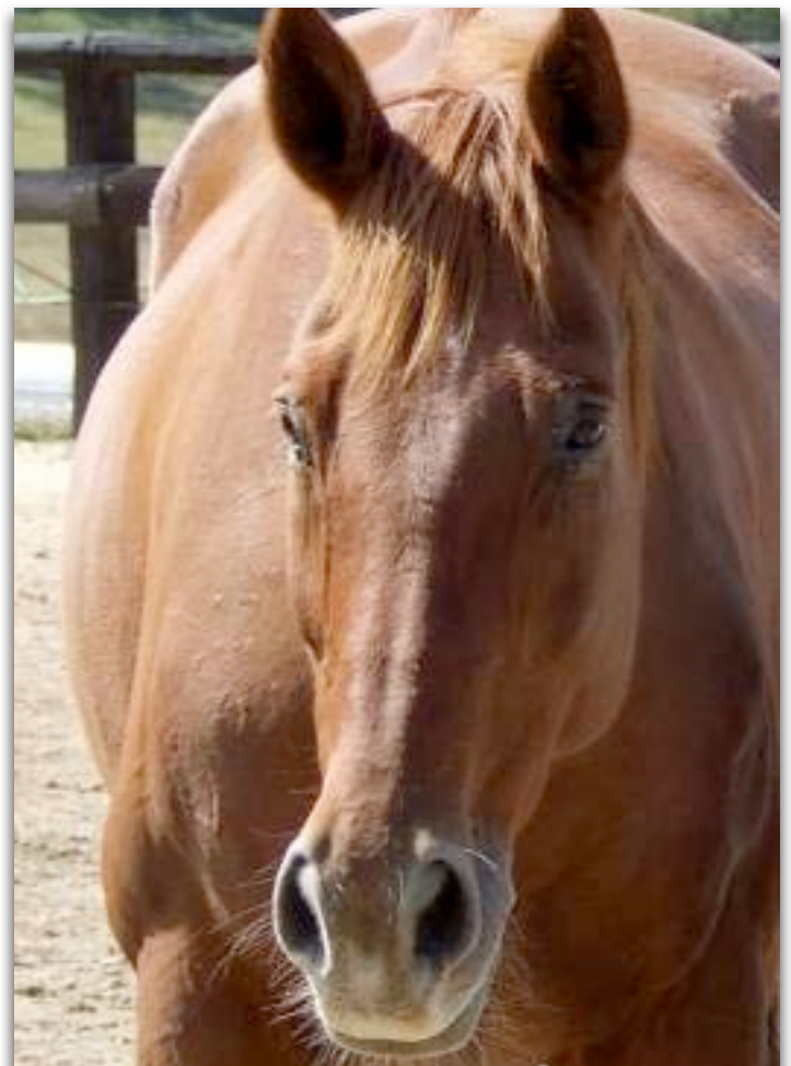
Attentive and interested