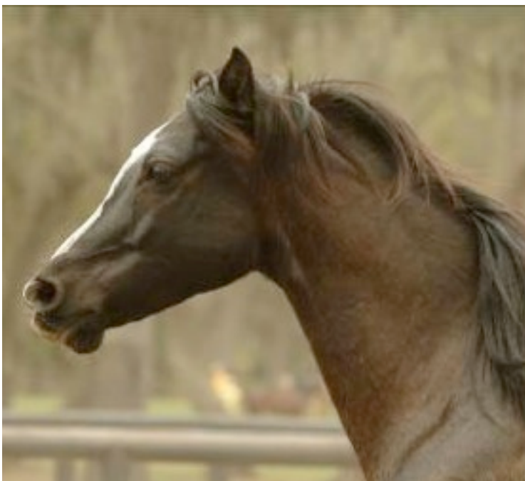
Apprehensive, tense and feeling pressured.