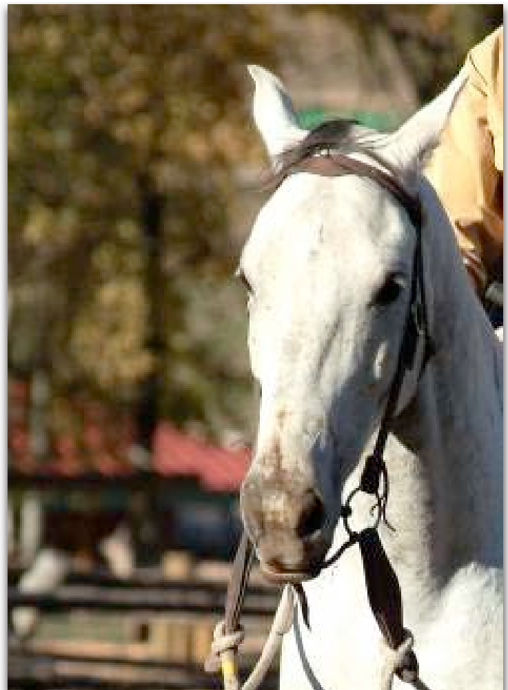
Tense, questioning everything that is going on, feels that there is a lot of pressure to achieve.