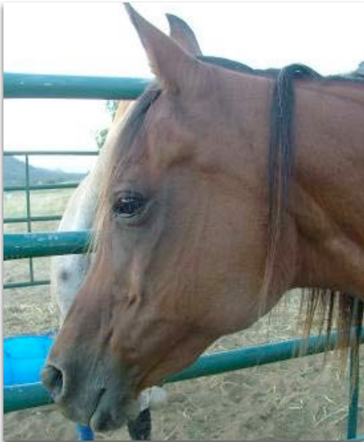
This mare is showing some of the more subtle signs of tension, stress and anxiety with a tight lower lip and tight facial muscles causing all of the veins of the face look prominent.