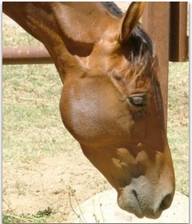
This horse is thinking and processing, probably about to lick its lips.