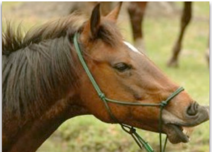
Feeling pretty good as she displays the flehmen response.