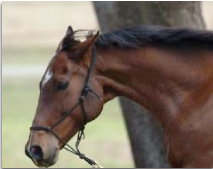
Very unhappy and uncomfortable.